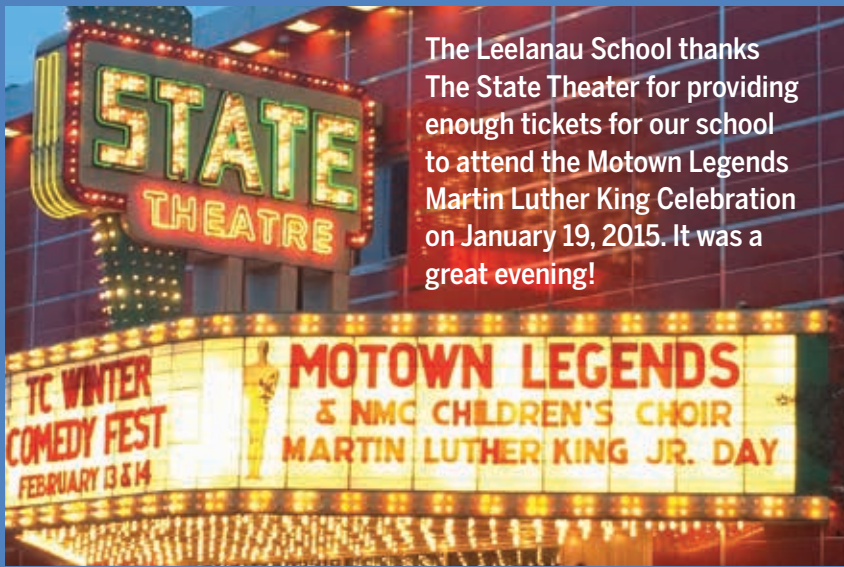
The Leelanau School thanks The State Theater for providing enough tickets for our school to attend the Motown Legends Martin Luther King Celebration on January 19, 2015. It was a great evening!