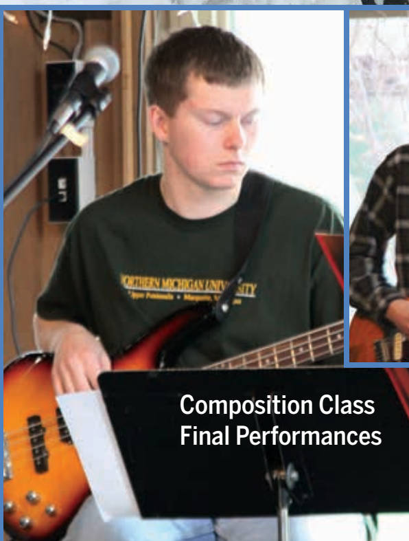
Composition Class Final Performances