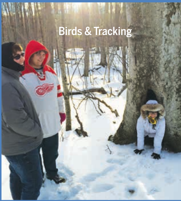
Birds & Tracking