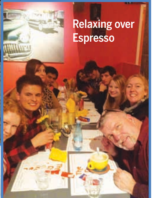
Relaxing over Espresso