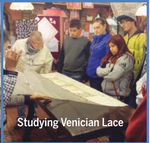
Studying Venician Lace