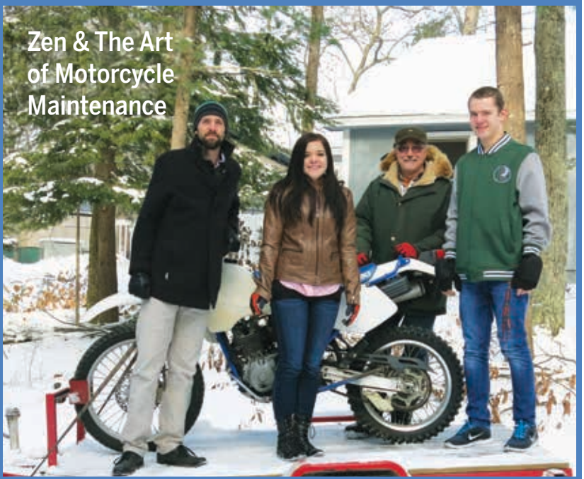
Zen & The Art of Motorcycle Maintenance