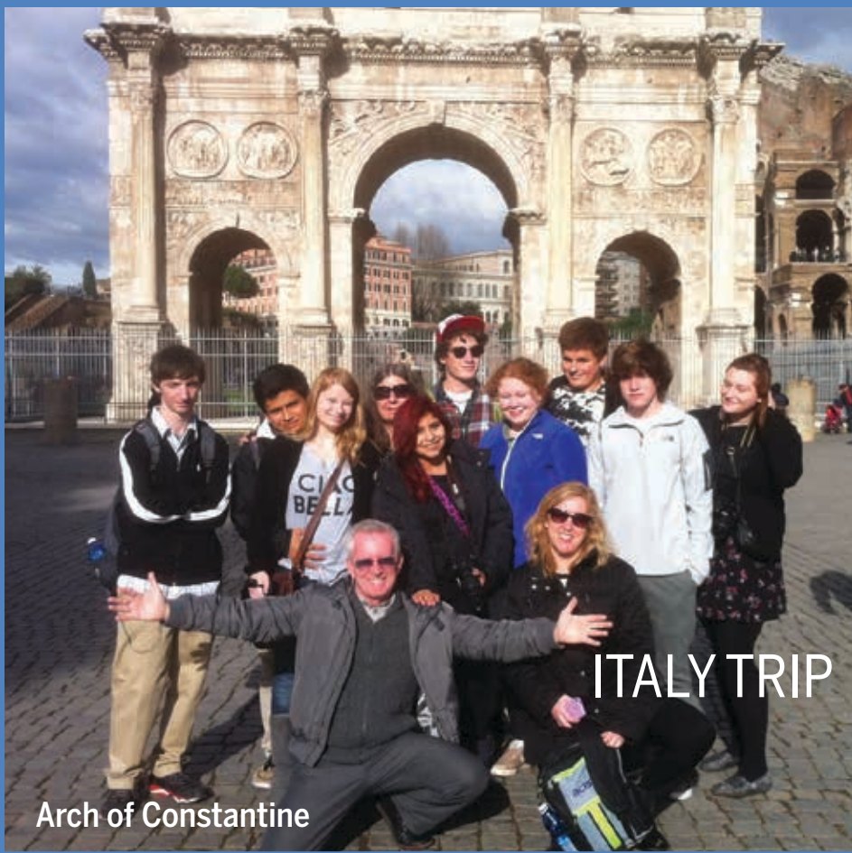
Arch of Constantine