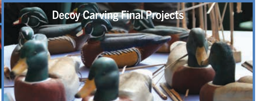
Decoy Carving Final Projects